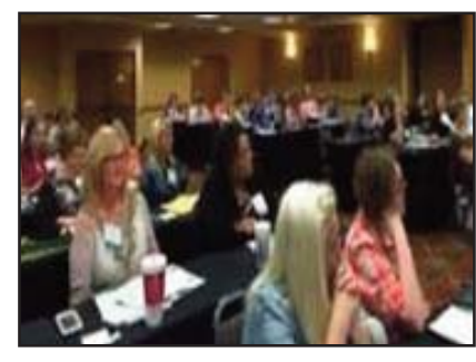
Missouri Health Science Educators

During the Missouri ACTE Summer Conference in July, MHSE had ten members participate in the Convoy of Hope, preparing and assembling packages. The MHSE Division also donated $403 to the PAC .... WAY TO GO!!!!